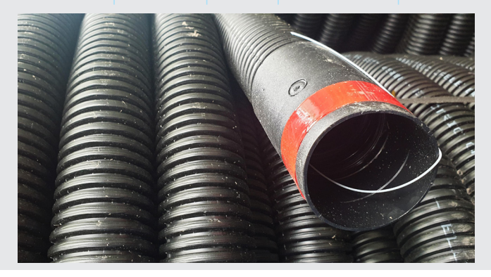
Fittings and Accessories